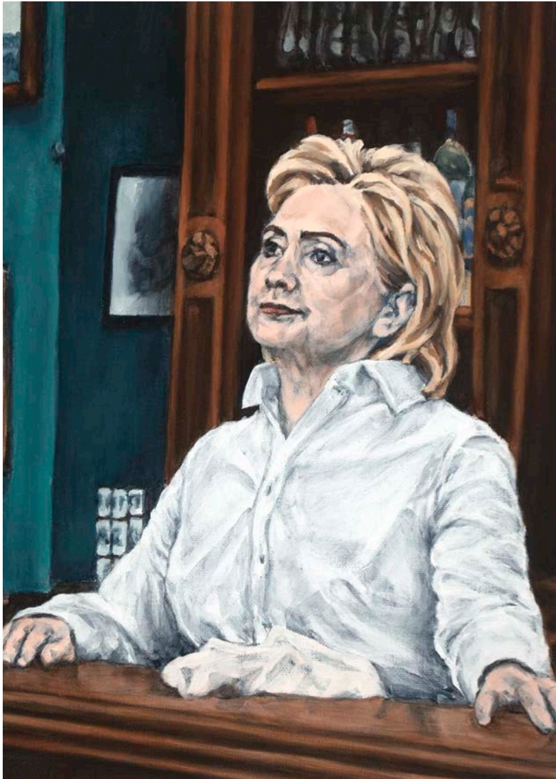
"Vol" by Sarah Sole Acrylic on canvas 14 in. x 11 in., 2017